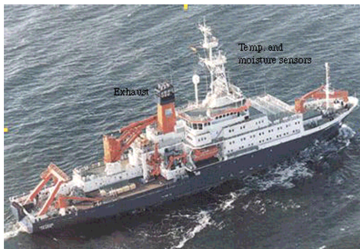
Figure 1: Research Vessel Meteor

The analyst attempted to flag all exhaust events with a "K". Differences in response time and exposure of the instruments resulted in varying times and amounts of flagging among the six different variables. In addition, the exhaust problem was not always discernable from normal background noise and some events may not have been flagged completely in all of the variables. The user may wish to apply an automated filter based on ship-relative wind direction, but such a task was beyond the scope of DAC quality control procedures. Figure 2 shows a typical plot of T, TD, RH, and PL_WDIR and the flagging