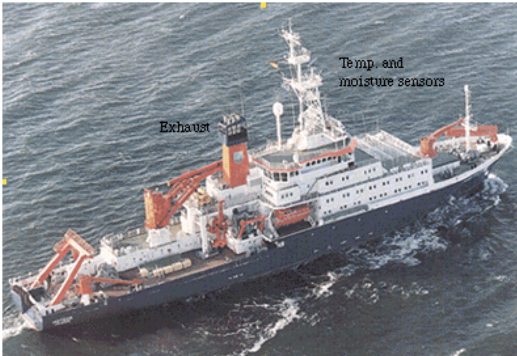
Figure 1: Research Vessel Meteor

The analyst attempted to flag all exhaust events with a “K”. Differences in response time and exposure of the instruments resulted in varying times and amounts of flagging among the six different variables. In addition, the exhaust problem was not always discernable from normal background noise and some events may not have been flagged completely in all of the variables. The user may wish to apply an automated filter based on ship-relative wind direction, but such a task was beyond the scope of DAC quality control procedures. Figure 2 shows a typical plot of T, TD, RH, and PL_WDIR and the flagging of these variables.