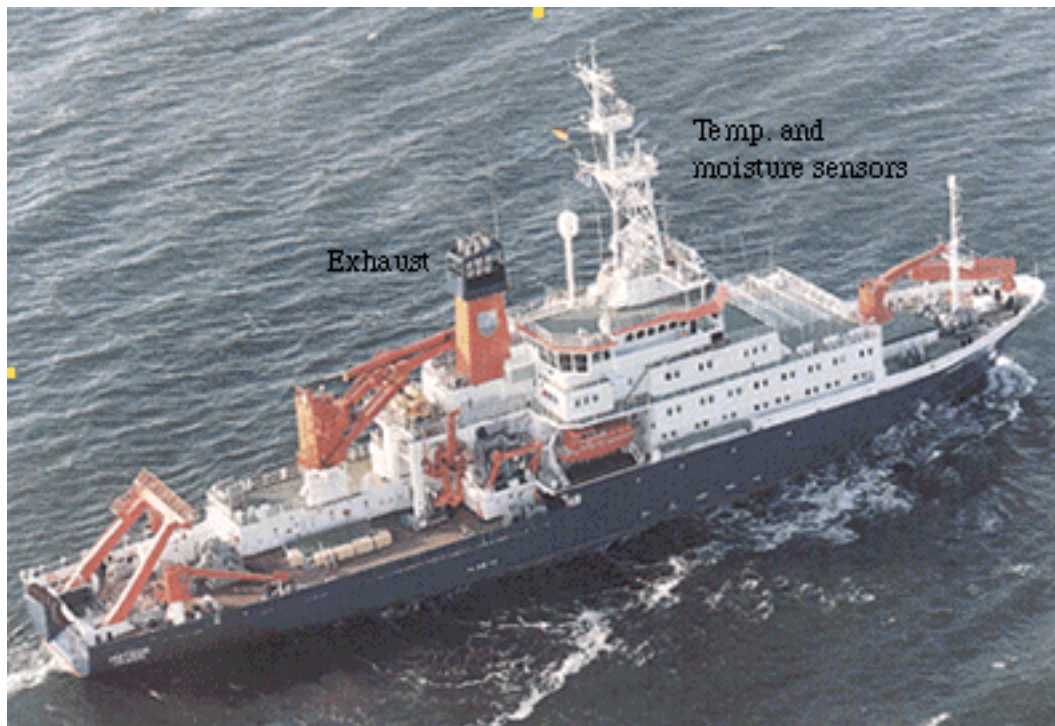
Figure 1: Research Vessel Meteor

The analyst attempted to flag all exhaust events with a “K”. Differences in response time and exposure of the instruments resulted in varying times and amounts of flagging among the six different variables. In addition, the exhaust problem was not always discernable from normal background noise and some events may not have been flagged completely in all of the variables. The user may wish to apply an automated filter based on ship-relative wind direction, but such a task was beyond the scope of DAC quality control procedures. Figure 2 shows a typical plot of T, TD, RH, and PL_WDIR and the flagging of these variables.